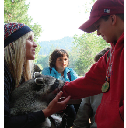
Students get hands-on with a raccoon!