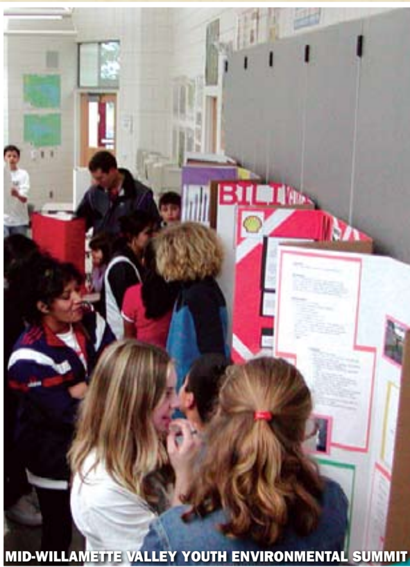
MID-WILLAMETTE VALLEY YOUTH ENVIRONMENTAL SUMMIT

Friends of Straub Environmental Learning Center 765 14th Street NE Salem, OR 97301