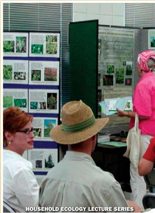
HOUSEHOLD ECOLOGY LECTURE SERIES