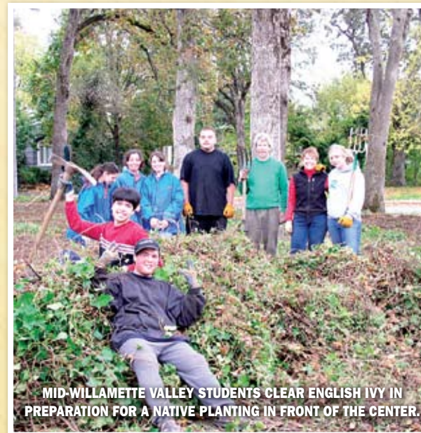
MID-WILLAMETTE VALLEY STUDENTS CLEAR ENGLISH IVY IN PREPARATION FOR A NATIVE PLANTING IN FRONT OF THE CENTER.