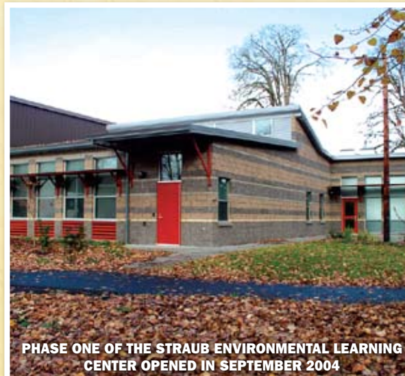
PHASE ONE OF THE STRAUB ENVIRONMENTAL LEARNING CENTER OPENED IN SEPTEMBER 2004

The centerpiece of the Friends' activities is the Straub Center, a structure that provides a lab, classroom, and meeting space for local organizations. Throughout the year, the Straub Center offers a stream of programs for students and adults alike, all designed to heighten concern and respect for Oregon's environment. The Straub Center also functions as a showcase of sustainable building and landscape practices.